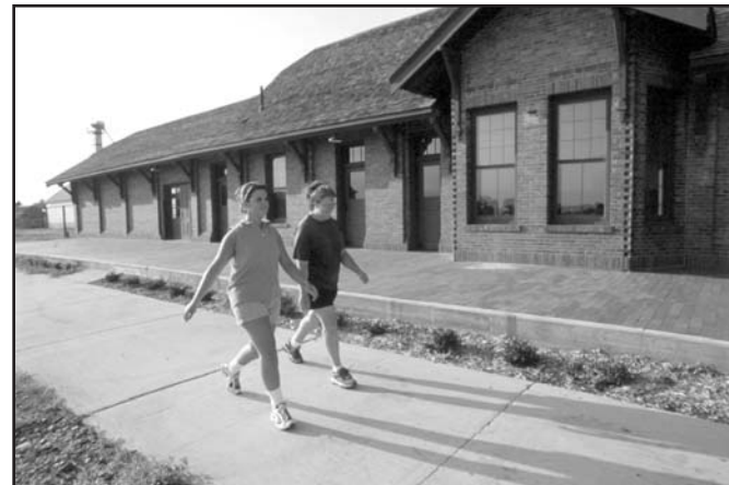
Trail users pass the O'Neill Depot Trailhead.